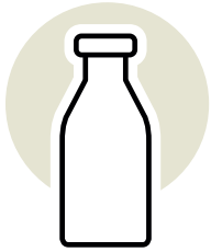
1L or 0.75L glass container (not included)