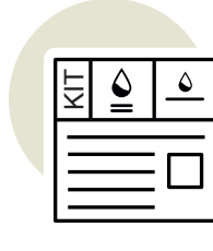
One label per bottle

The one-liter bottles that are used for fruit juices are ideal because they have a large opening that makes it easy to fill with chips or stave pieces. Each sample bag contains 10g which is exactly the dose to be used for one liter.